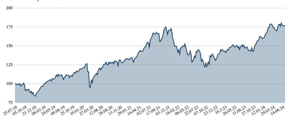
NAV European Selection Fund